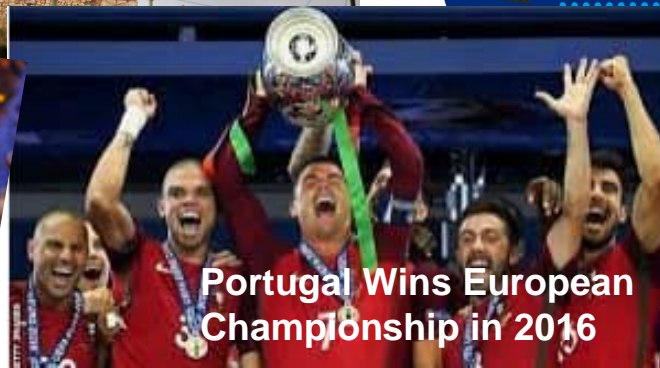
Portugal Wins European Championship in 2016