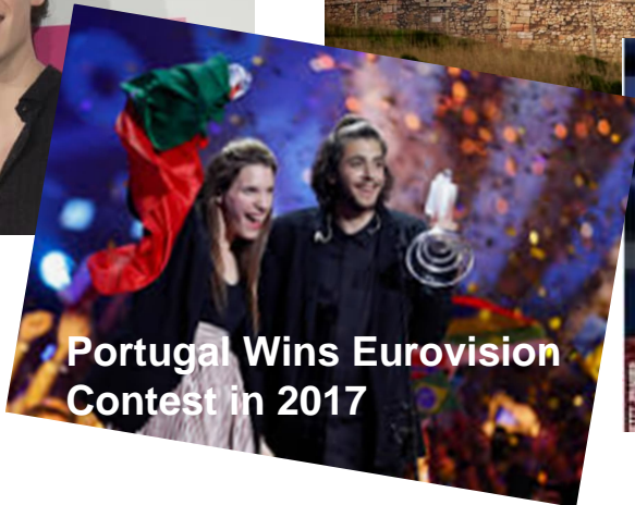
Portugal Wins Eurovision Contest in 2017