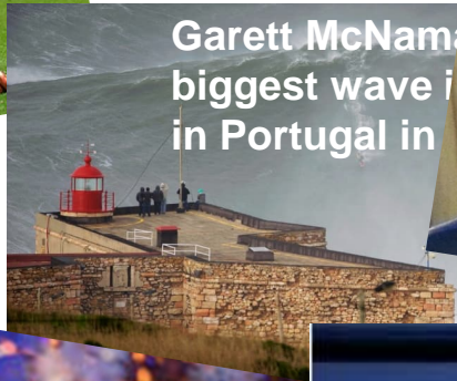
Garett McNamara biggest wave in in Portugal in