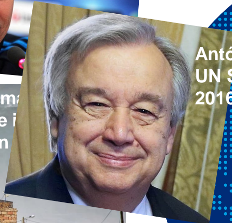
António Guterres became UN Secretary-General in 2016